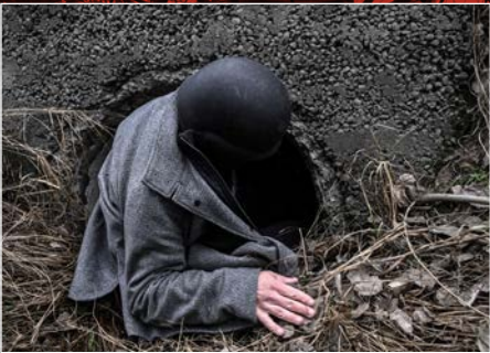
CPJ disbursed crucial safety advice in Ukrainian, Russian, and English to help journalists who cover the war. These advisories cover a wide range of situational risks—from civil disorder, arrest and detention, and internet shutdowns, to assessing digital threats. CPJ also offers one-on-one safety consultations for more specific questions journalists ask.

Here are some of the ways we’re taking action.