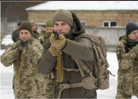
CPJ mobilized to secure a statement on journalist safety from the Media Freedom Coalition. We worked to ensure the inclusion of journalists in accountability processes with the OSCE Moscow Mechanism—established to assess potential war crimes in Ukraine—and we liaised with USAID and the U.S. National Security Council to share the concerns of journalists in Ukraine.

Yuri Butusov, a well-known Ukrainian journalist, trains as a member of Ukraine’s defense forces.