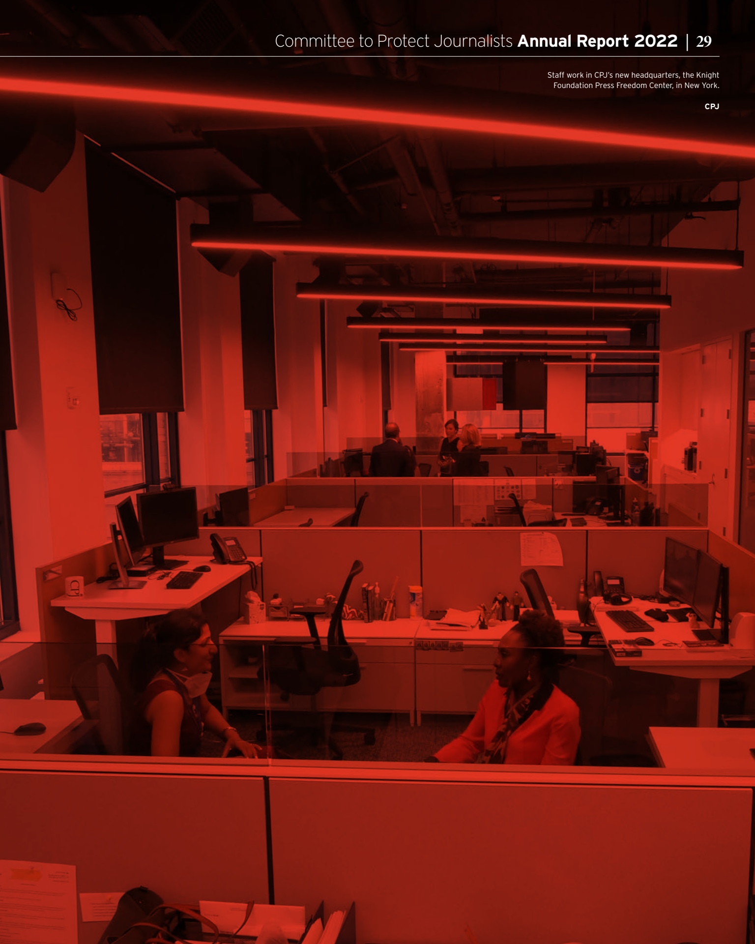
Staff work in CPJ's new headquarters, the Knight Foundation Press Freedom Center, in New York.