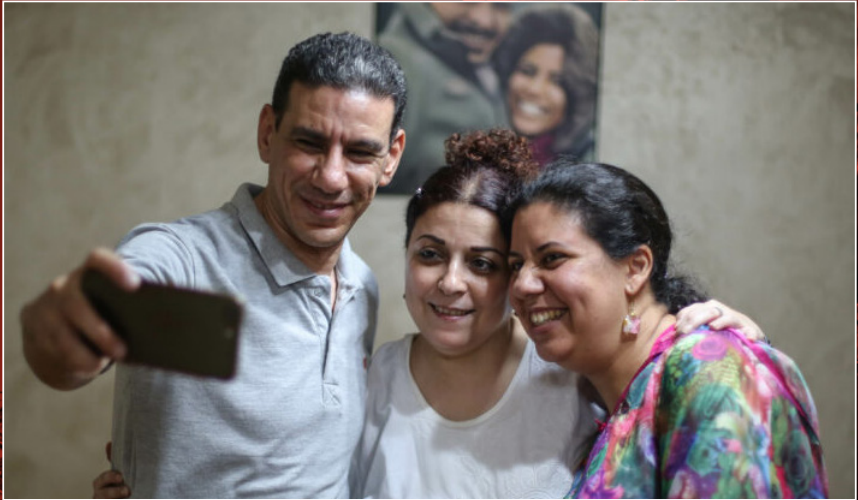
Egyptian activist and journalist Esraa Abdelfattah (center) after being released from prison where she was held in pretrial detention since her arrest in October 2019.